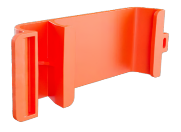
Bladder Attachment Clip