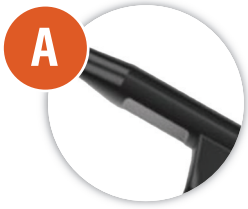
STROBE LIGHT Antenna can be unscrewed and detached for easy storage