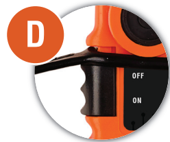
ARMING SWITCH Arming switch, locks in and clearly displays if the MSLD is ON or OFF