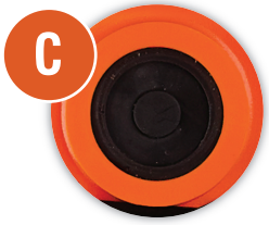
MANUAL ACTIVATION Easy push button allows the MSLD to be manually activated